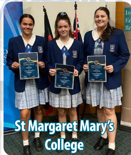
St Margaret Mary's College