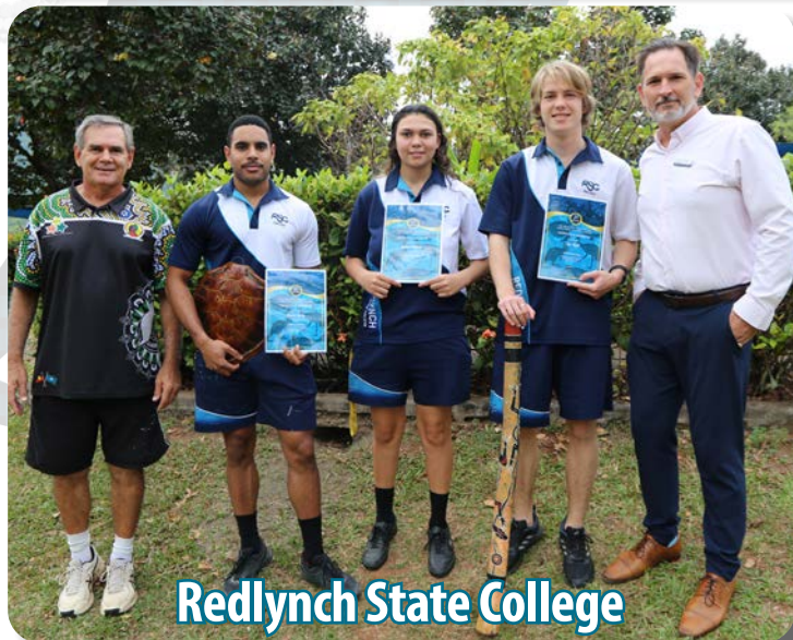
Redlynch State College