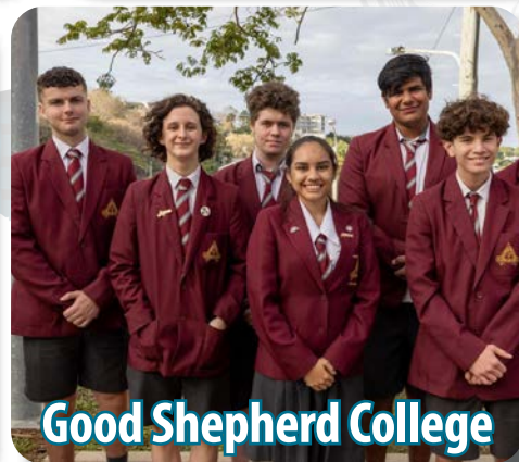
Good Shepherd College