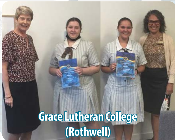
Grace Lutheran College (Rothwell)