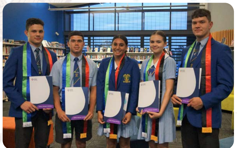
St Peter Claver College