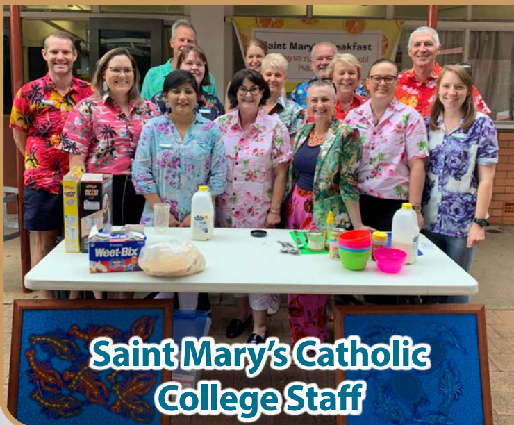
Saint Mary's Catholic College Staff