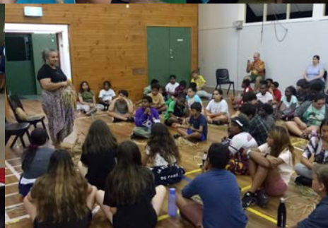
Basket weaving, reflecting ATSI traditions, hunting, and the connections to family and Country.