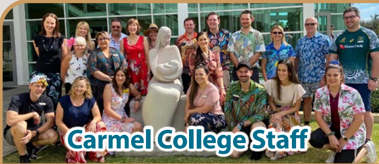
Carmel College Staff