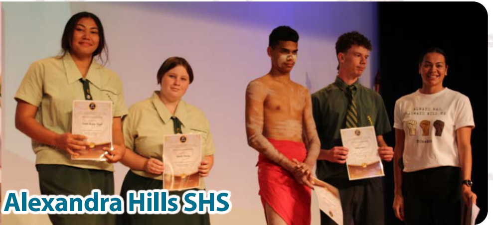
Alexandra Hills SHS