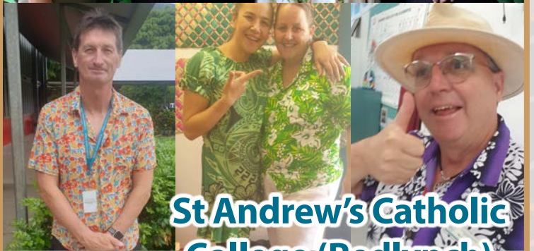
St Andrew's Catholic College (Redlynch)