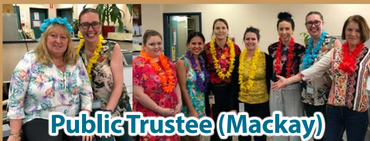
Public Trustee (Mackay)