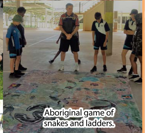
Aboriginal game of snakes and ladders.