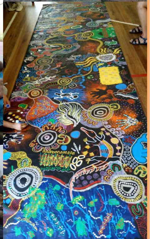
Indigenous Mural of Leadership 'Spirit of Country'.