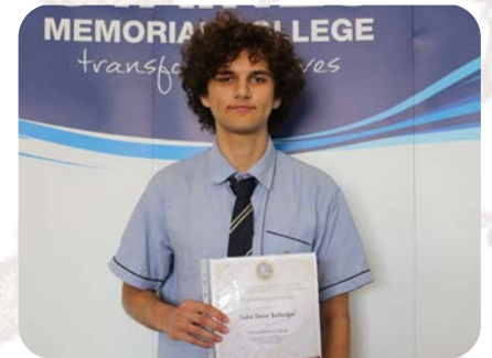
Staines Memorial College