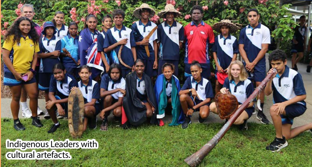
Indigenous Leaders with cultural artefacts.