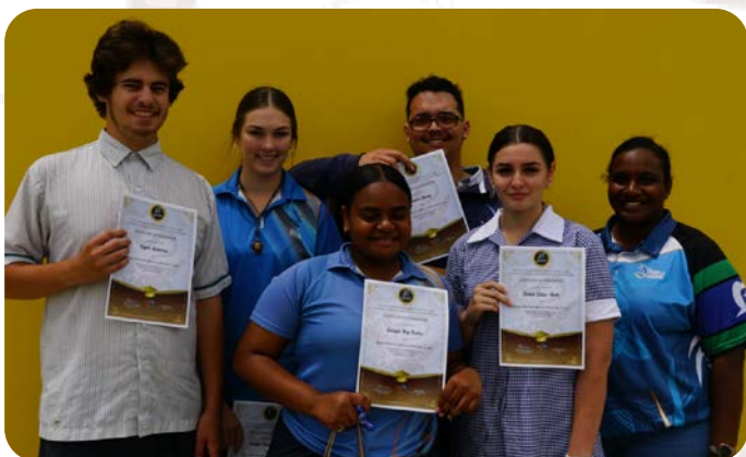
Mackay Northern Beaches SHS