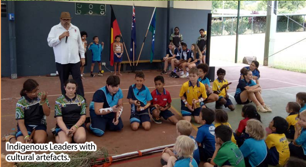
Indigenous Leaders with cultural artefacts.