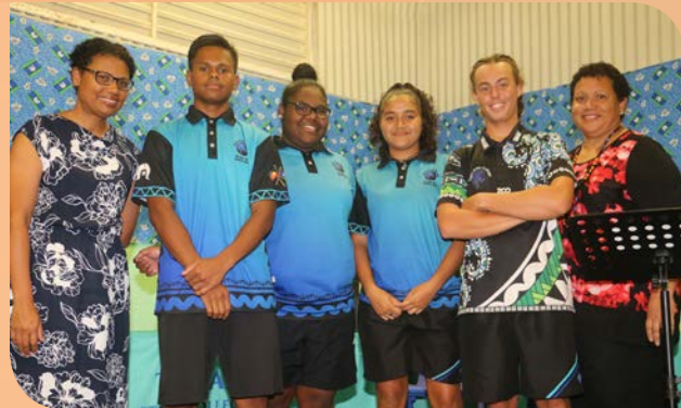
Tagai State College Secondary Campus 2020 School and Vice Captains.

We have a QATSIF Leadership badge and certificate which can be presented to them at school or at one of our New Recipients' celebrations at ACU (Banyo) on 21 Feb 2020 or USQ (Springfield) on 28 Feb.