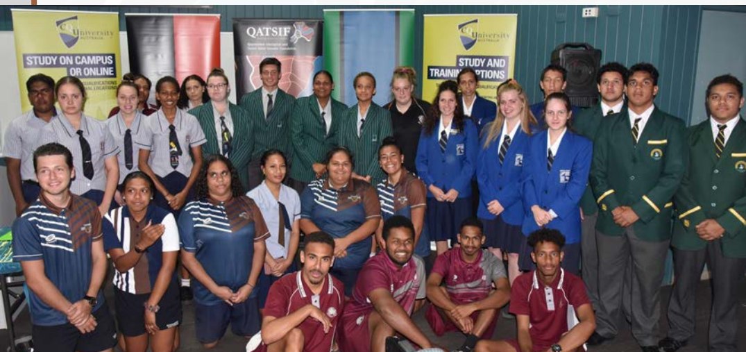
2019 QATSIF QCE Scholarship graduates in attendance at CQU Rockhampton North Campus.

QATSIF is also very grateful to the representatives from the Public Trustee head and regional offices who came along to present our graduation certificates on behalf of the Public Trustee of Queensland.