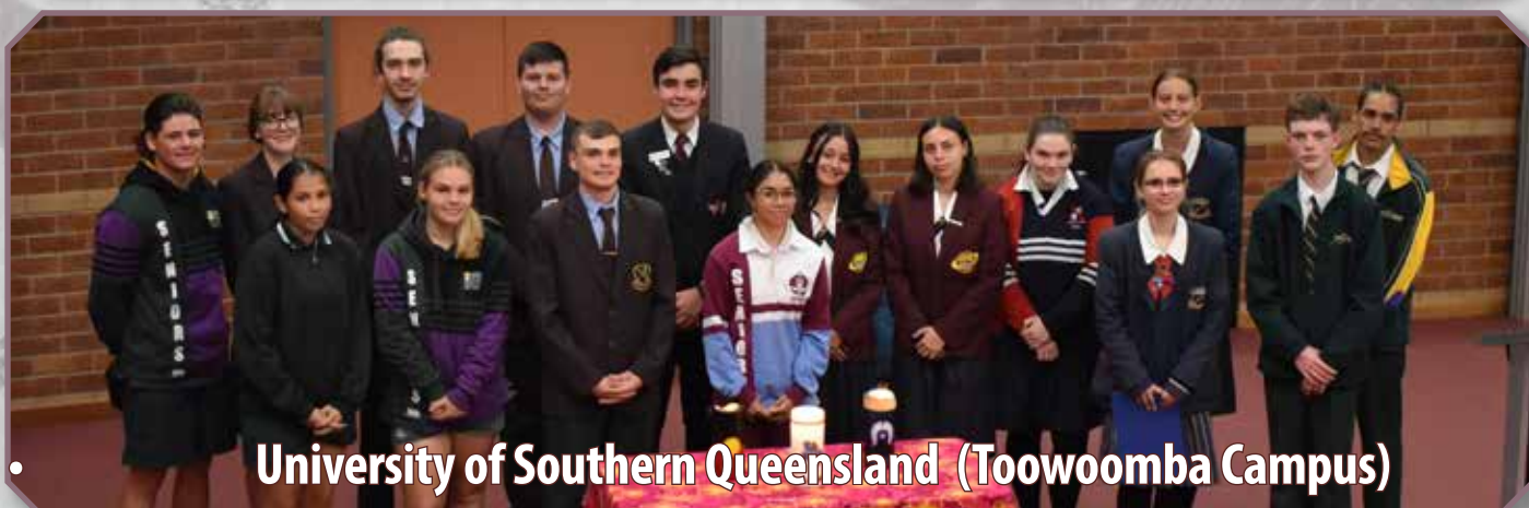
University of Southern Queensland (Toowoomba Campus)