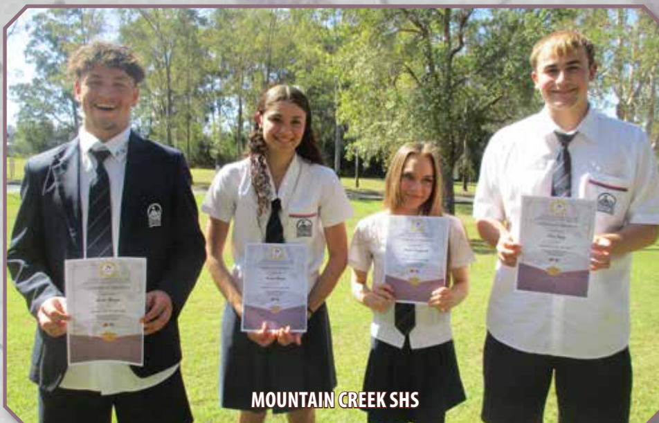
MOUNTAIN CREEK SHS