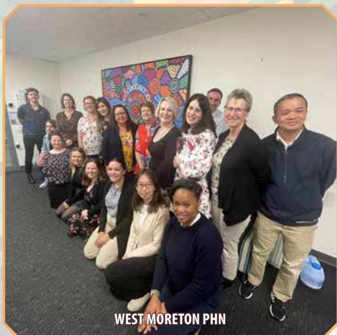
WEST MORETON PHN

We were also very pleased to see so many schools using the Torres Strait Islander resources that we shared