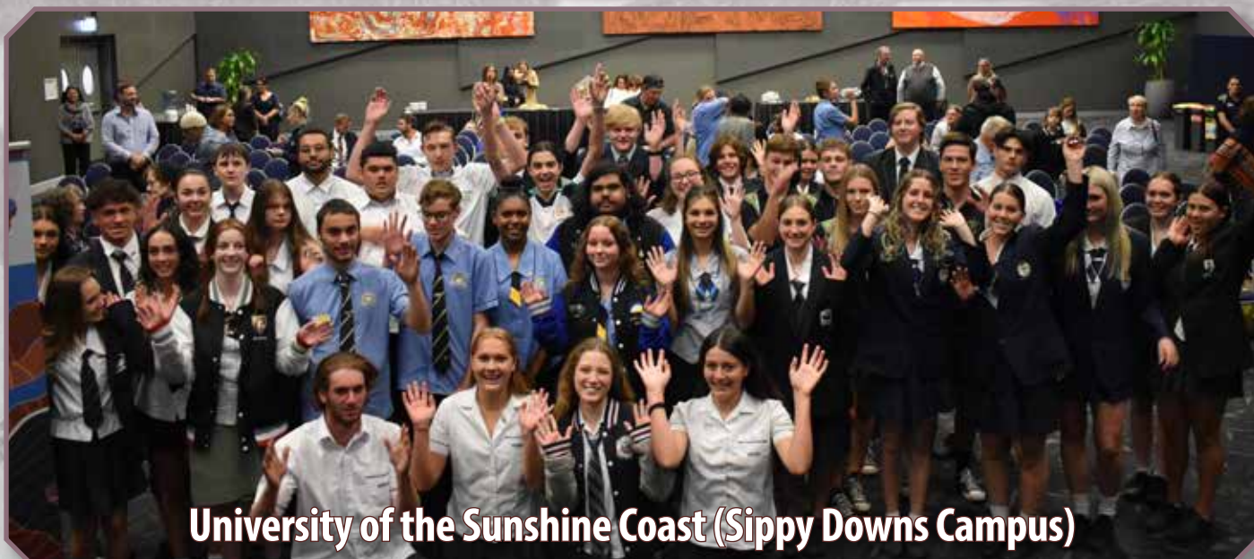
University of the Sunshine Coast (Sippy Downs Campus)