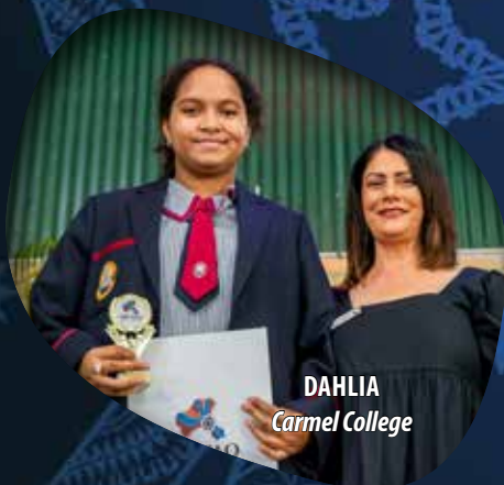
DAHLIA Carmel College