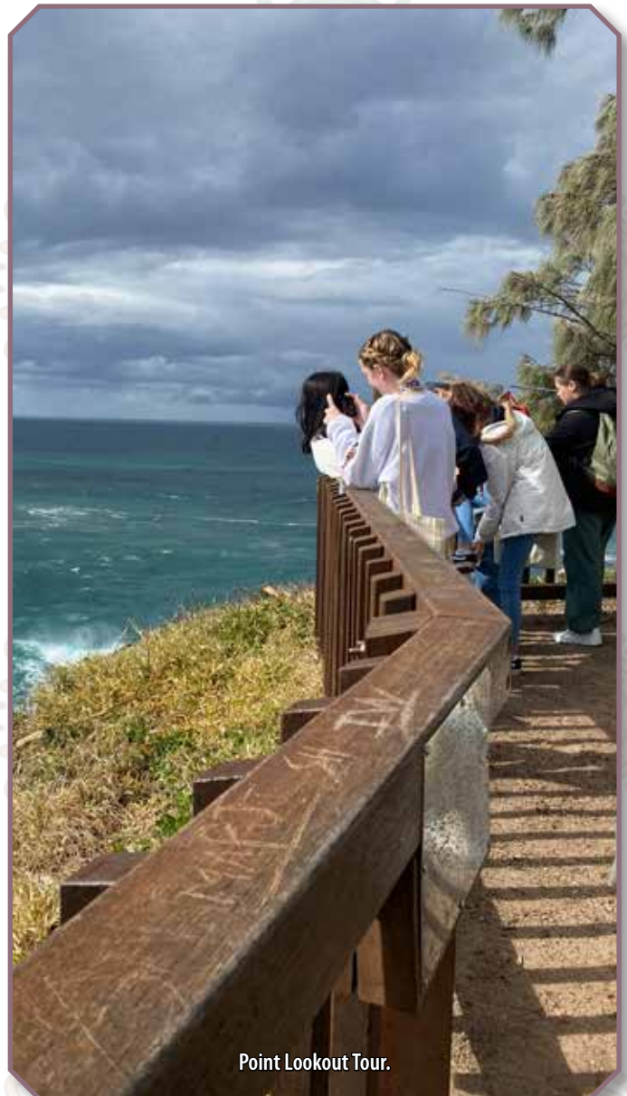
Point Lookout Tour.