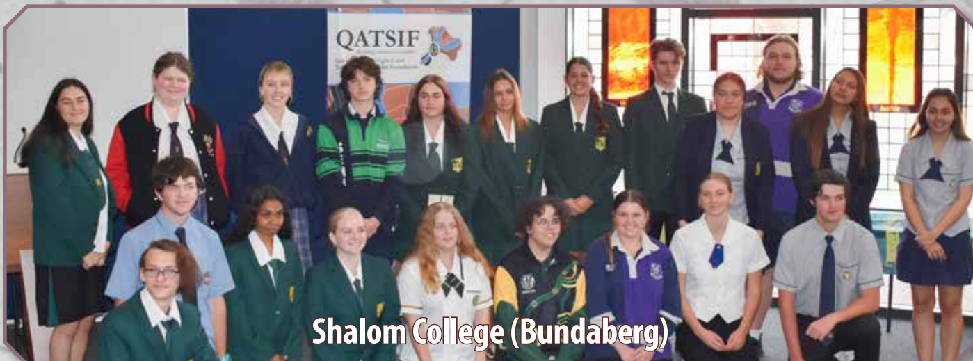
Shalom College (Bundaberg)