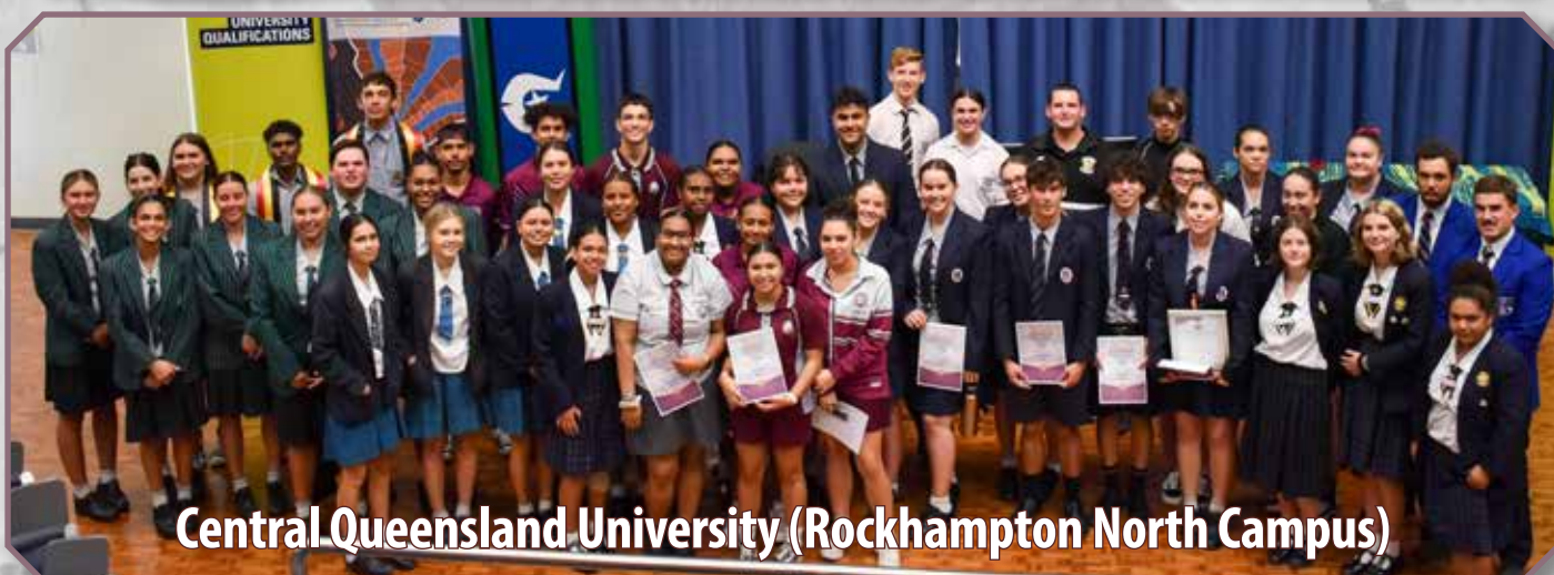
Central Queensland University (Rockhampton North Campus)