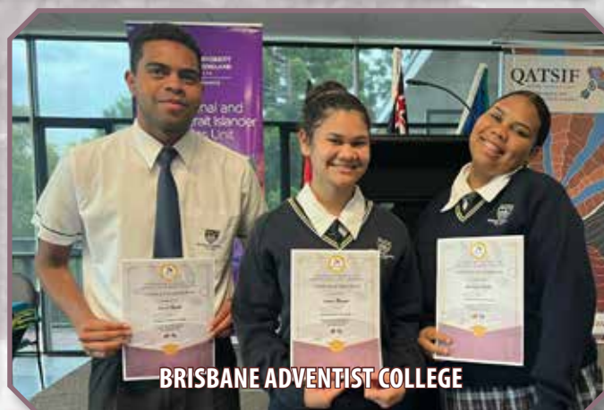
BRISBANE ADVENTIST COLLEGE