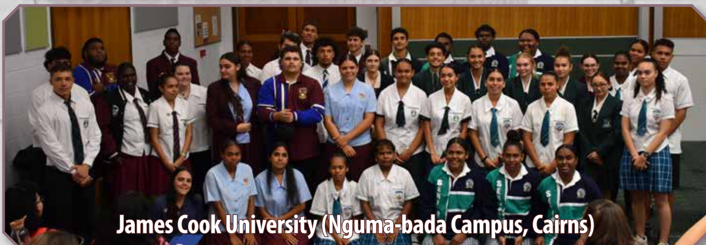
James Cook University (Nguma-bada Campus, Cairns)