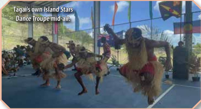
Tagai's own Island Stars Dance Troupe mid-air.