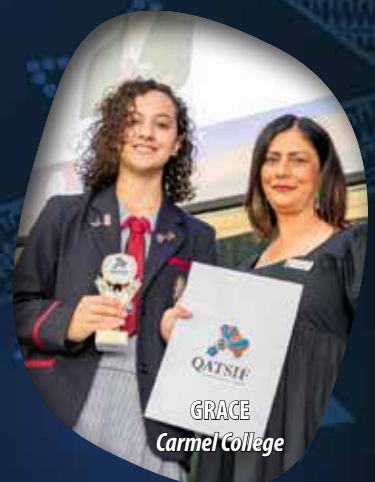
GRACE Carmel College