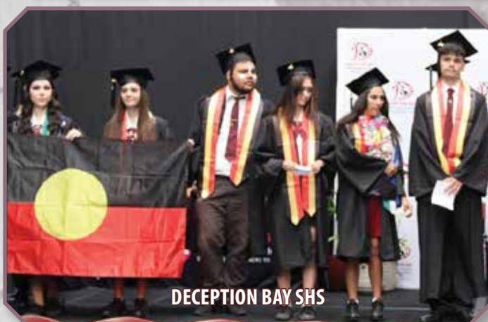
DECEPTION BAY SHS