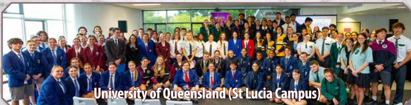
University of Queensland (St Lucia Campus)