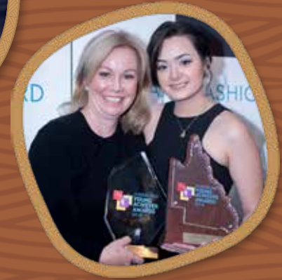
2016 JUSTICE KING 2016 QUEENSLAND YOUNG ACHIEVER OF THE YEAR

These awards acknowledge, encourage and most importantly promote the positive achievements of all young people throughout Queensland up to and including 29 years of age.