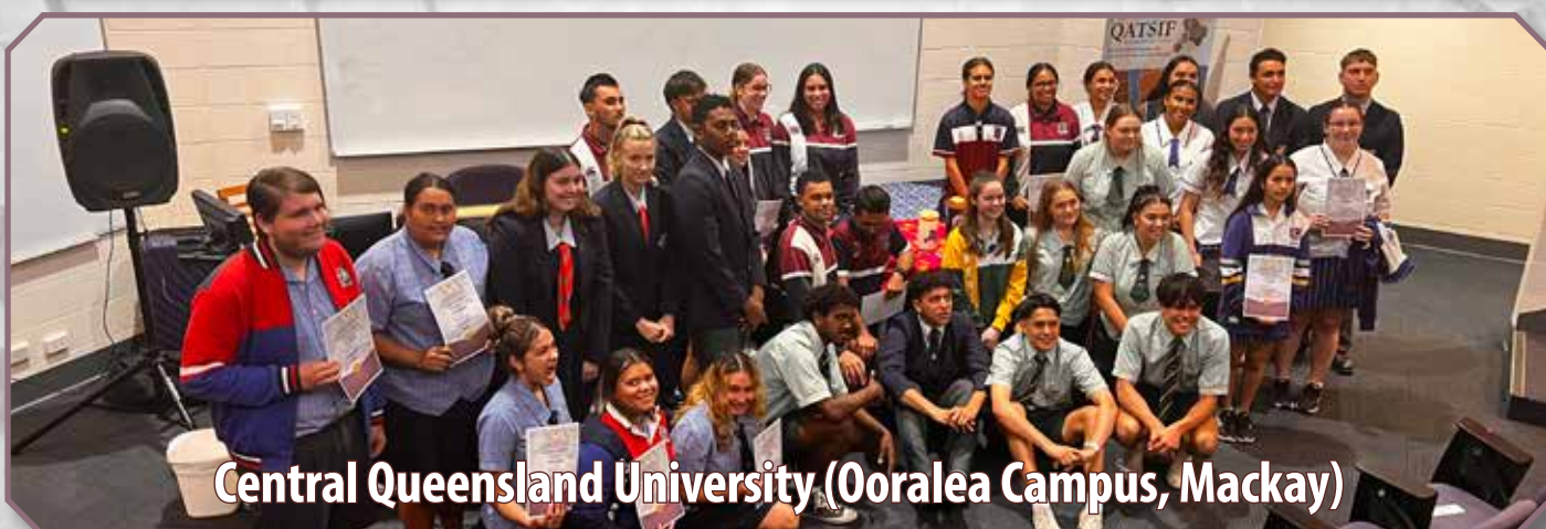
Central Queensland University (Ooralea Campus, Mackay)