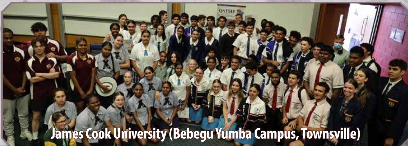
James Cook University (Bebegu Yumba Campus, Townsville)