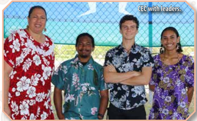
CEC with leaders.